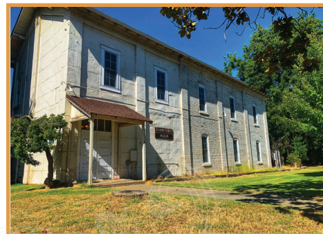
Tehama County Museum

Visit the Tehama County Museum (open Saturdays) or Kelly Griggs (make an appointment) to brush up on your local history.